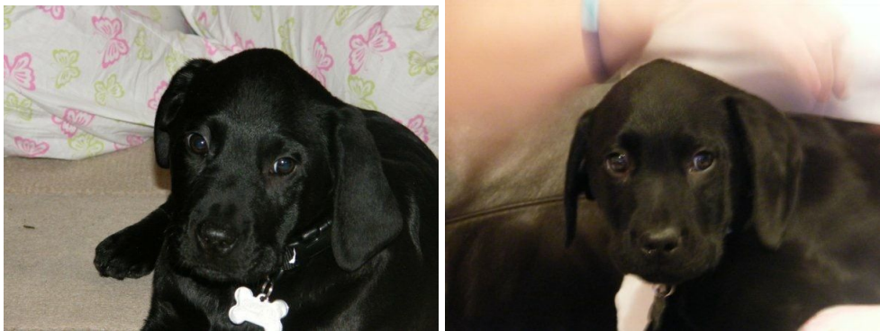
ARNOLD AT 11 WEEKS OLD.

MY MUM AND DAD GOT ARNOLD BEFORE I WAS BORN, ON THE 17 JANUARY 2009 HE WAS ONLY 11 WEEKS OLD .