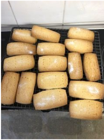
These are our all butter shortbread.