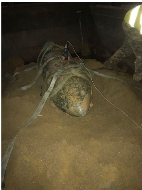
This is the bomb strapped on top of the truck