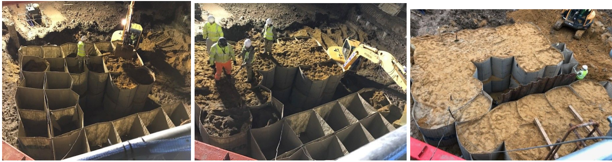
These are the sandbags they used to make the sang igloo.