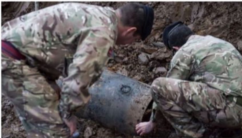
This was when dad had to check what kind of bomb it was.(it was a high explosive bomb)