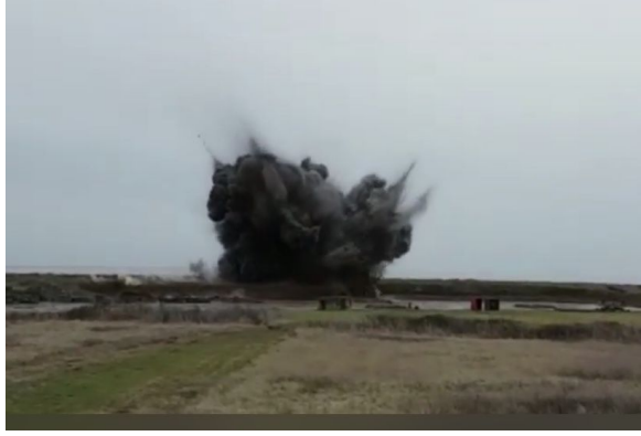
This is the navy blowing the bomb up on a beach.