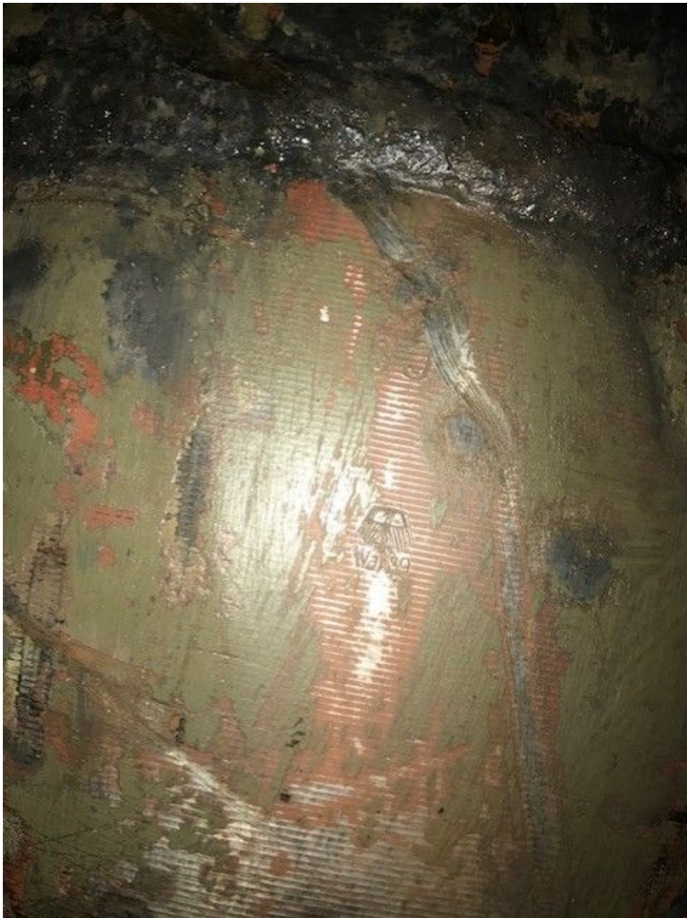
This was one of the markings on the bomb, it is the german war office eagle.