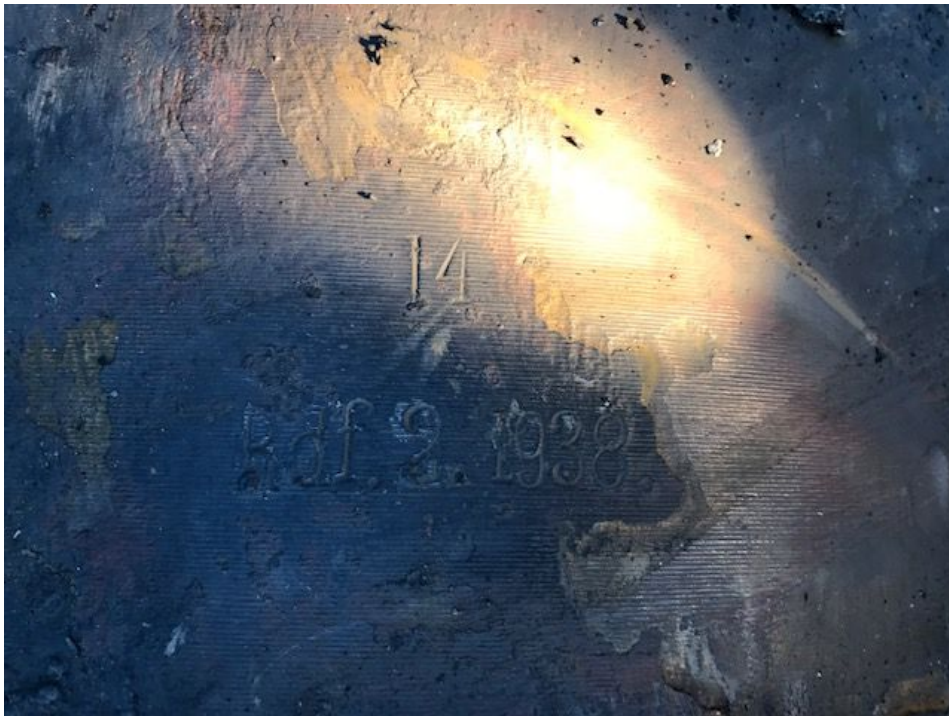
This was the other marking, it is the year it was made(1938).