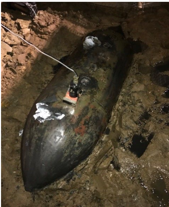
This is the mic they used to make sure it didn't start ticking.